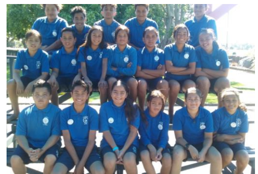
2017 Bus monitors

Our bus monitors are working hard to try and keep everyone happy and safe on the bus. However, it has come to my attention that some children are walking around or standing on the bus while it is moving and some children are playing on the road when waiting for the bus. Can you please help our bus monitors and the school by reminding your tamariki of our bus rules.